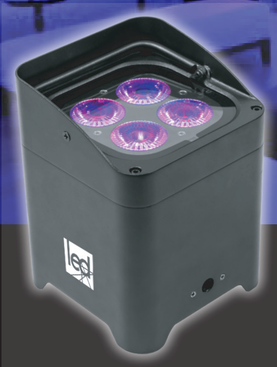
LED UP QUAD 4 LEDSET004